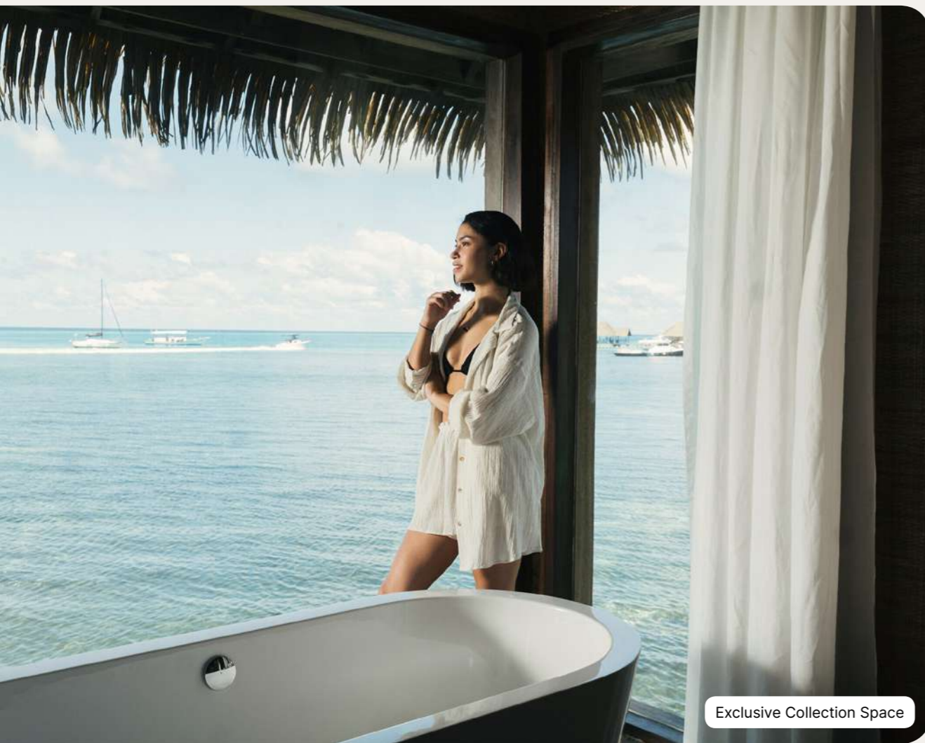
Exclusive Collection Space